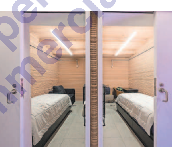
Crews on Mars will have to be together for a long time — perhaps 2½ years — so the habitat includes individual living quarters, allowing for a little bit of privacy and solitude when needed.

A deep bench of experts — including specialists in behavioral health, nutrition, food sciences and kinesiology — helped NASA design CHAPEA, and will help it mine the data it collects for best practices that it eventually will use to design an actual Mars habitat.