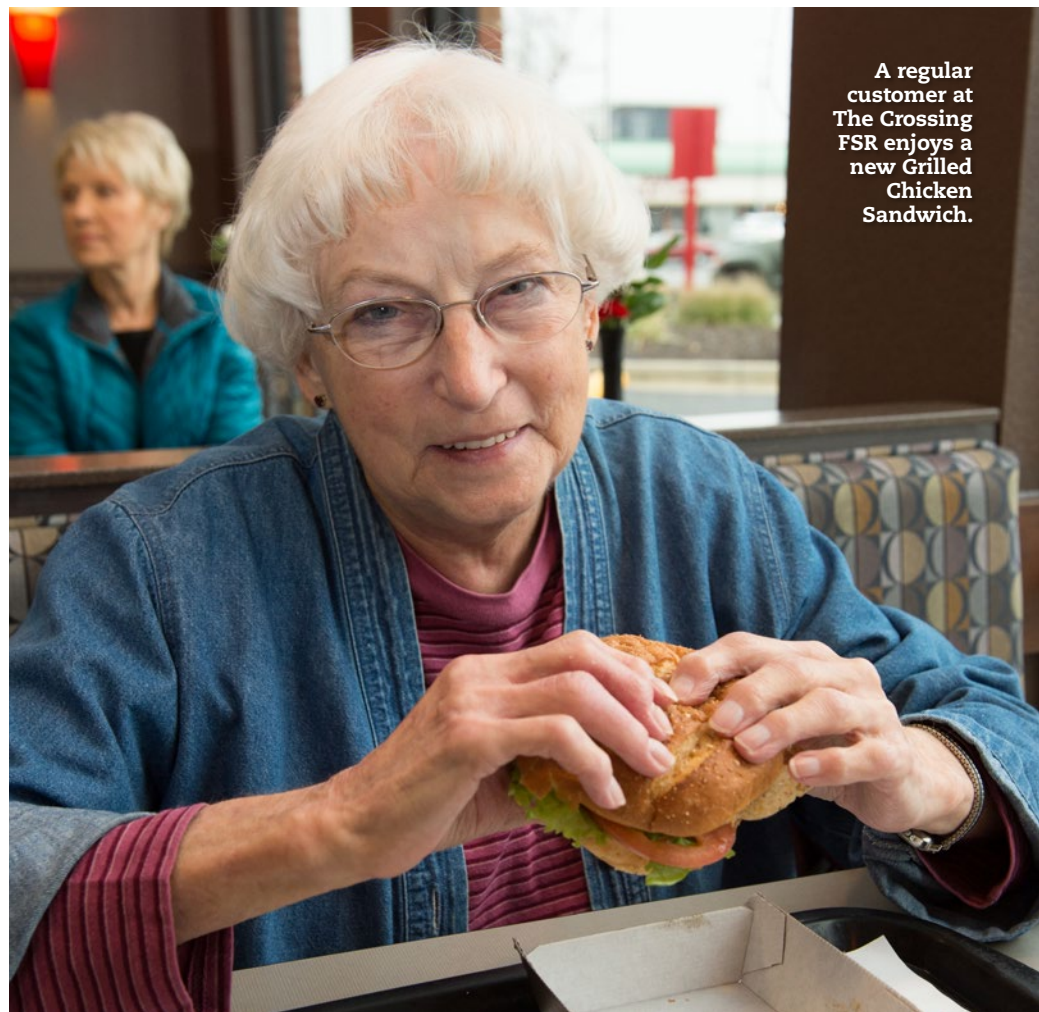
A regular customer at The Crossing FSR enjoys a new Grilled Chicken Sandwich.