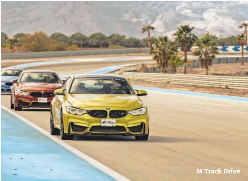
M Track Drive