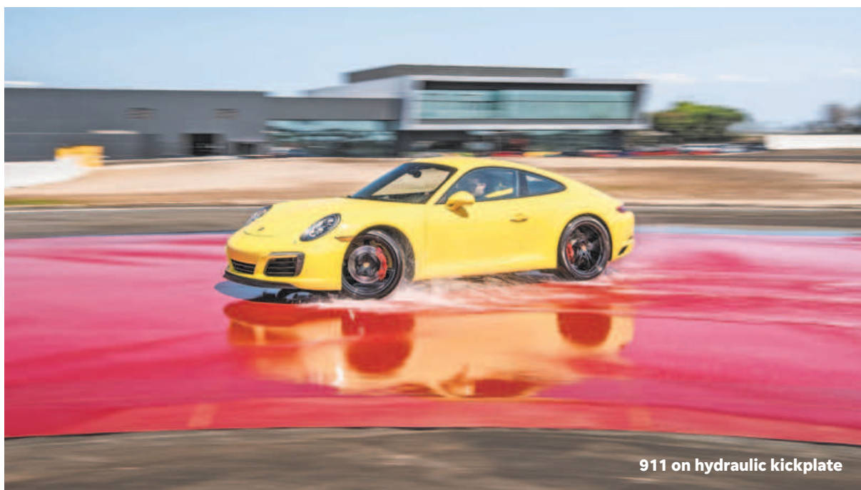
911 on hydraulic kickplate