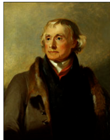
Thomas Jefferson was the country's first vice president, a two-term president and founder of the University of Virginia. He was also a slaveholder.